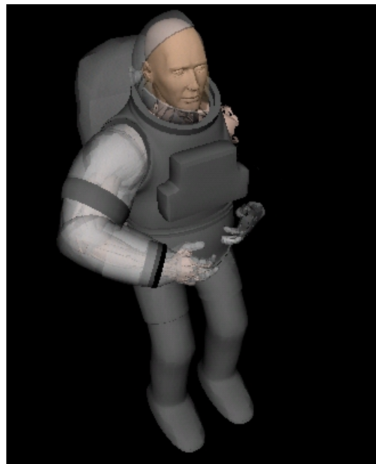
Figure 3. Astronaut & EMU geometry by Tietronix Software Inc.

This research is largely composed of two parts. The first part is modeling a deformable human arm based on these empirical biomechanical properties and calculating the deformation due to various contact areas. The second part is evaluating the reachable space (reachability) from the arm deformation in a given geometric (CAD) environment. Using the empirical force-displacement relation we have built a simple human arm model that deforms using a finite element method. We are now working on a human within an EMU model with more detailed geometry provided by Tietronix Software (Figure 3).